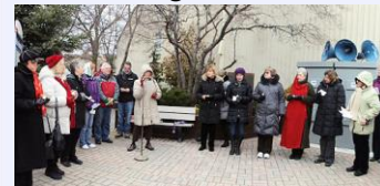
CFUW Southport candlelight vigil

CFUW Southport held a candlelight service in honour of the women killed at École Polytechnique (Dec. 6) which was attended by the mayor, Council members and members of the public. The presentation garnered newspaper and radio coverage of the event, helping to bring attention to the issue of violence against women.