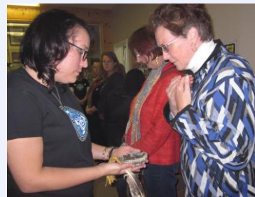
Sisters in Spirit Vigil

• CFUW St. John's has now taken over the Fresh Start Basket project, which provides care packages to women hoping to make a fresh start -- now supported entirely by CFUW St. John's.