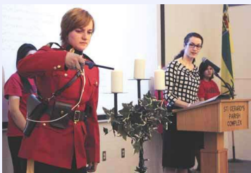
Cyberbullying panel discussion